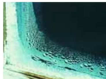
Window condensation can fuel mold growth.

Computer simulations conducted by Enermodal Engineering, a certified independent third party testing facility. Super Spacer® is a registered trademark of Edgetech IG Inc. Swiggle® is a registered trademark of TruSeal. Intercept® is a registered trademark of PPG Industries, Inc.